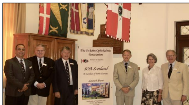
Launch event, SOA-Scotland Jerusalem 2019

In September SOA-Scotland was launched. The event was led by the Scottish Hospitaller, and supported by the Prior of Scotland the Chair of the Hospital, and our CEO. It formed part of a larger Scottish Symposium, conducted in the Hospital Chapel, and itself part of the 2019 SOA Hospital and History Summit. The SOA is proud to have the Scottish branch formally part of the Association.