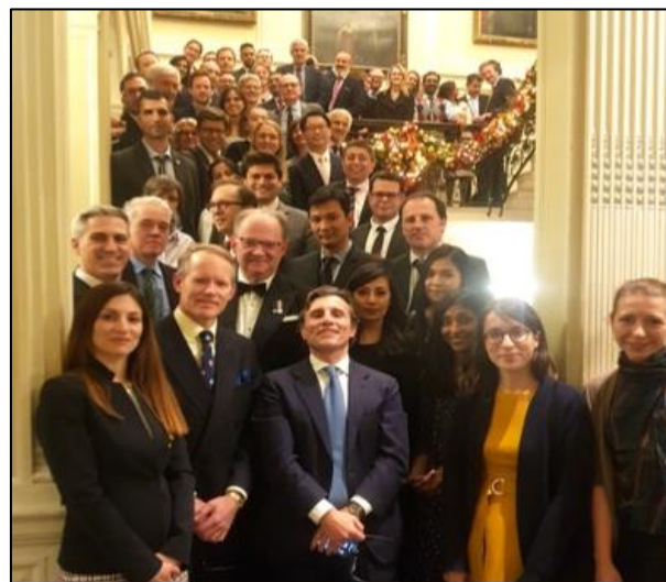
Delegates at the first St John Masterclass in London

The Masterclass was professionally recorded, forming the basis for future on-line educational material.