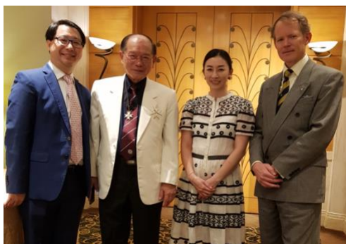
Launch of the Singaporean Branch of the Asia Pacific Chapter

In January 2021 SOA-Asia Pacific is organising the second in our Masterclass series , with a two-day congress on the ocular surface and its protection.