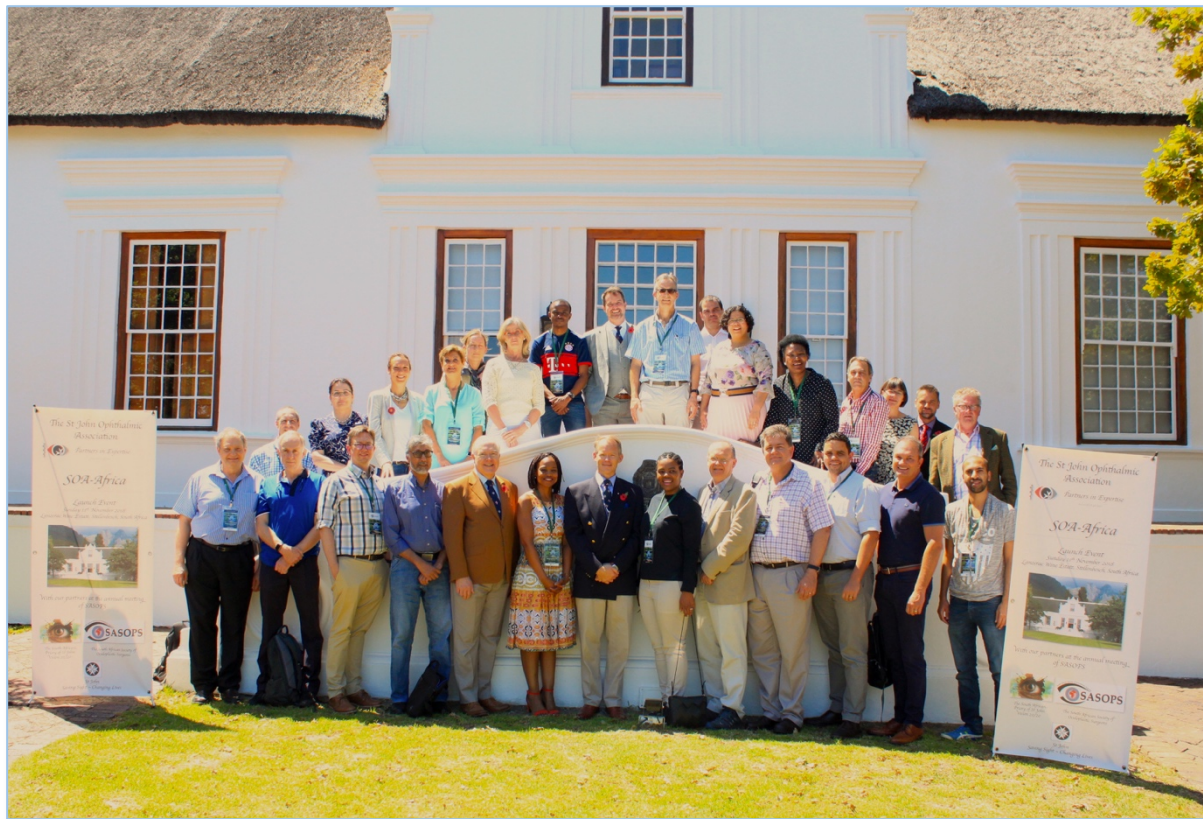
Launch of the African Chapter of the St John Ophthalmic Association, hosted by SASOPS